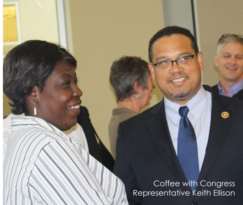
Coffee with Congress Representative Keith Ellison