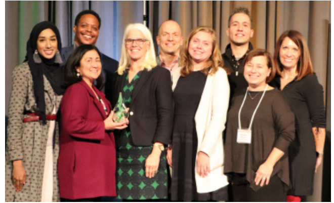
The Blue Cross and Blue Shield of Minnesota Foundation (and friends) accepting their Mission Award at the 2019 MCN Annual Conference.

In 2017, the Foundation met with, invited, and deployed the $300,000 to fund ten nonprofits working on the front lines with their communities to promote safety and quell fears. The board approved additional funds in 2018 to continue this work and ten additional grants totaling $250,000 were approved. In 2019, the Foundation funded $1M in grants aimed at helping to create safer, more welcoming and more connected communities.