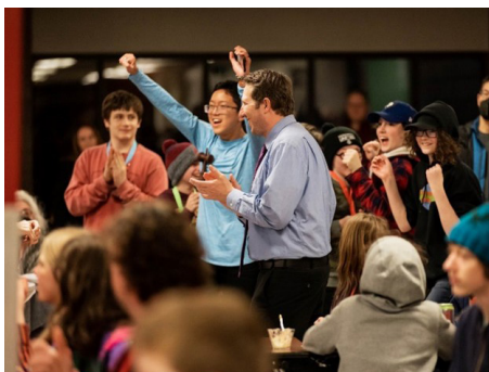
Photo credit: Marina Que. Pictured: students at MNUDL's debate tournament.

Skye graciously invites me to join them for a day in their life as a VISTA member and we embark on a tour of the bustling tournament site.